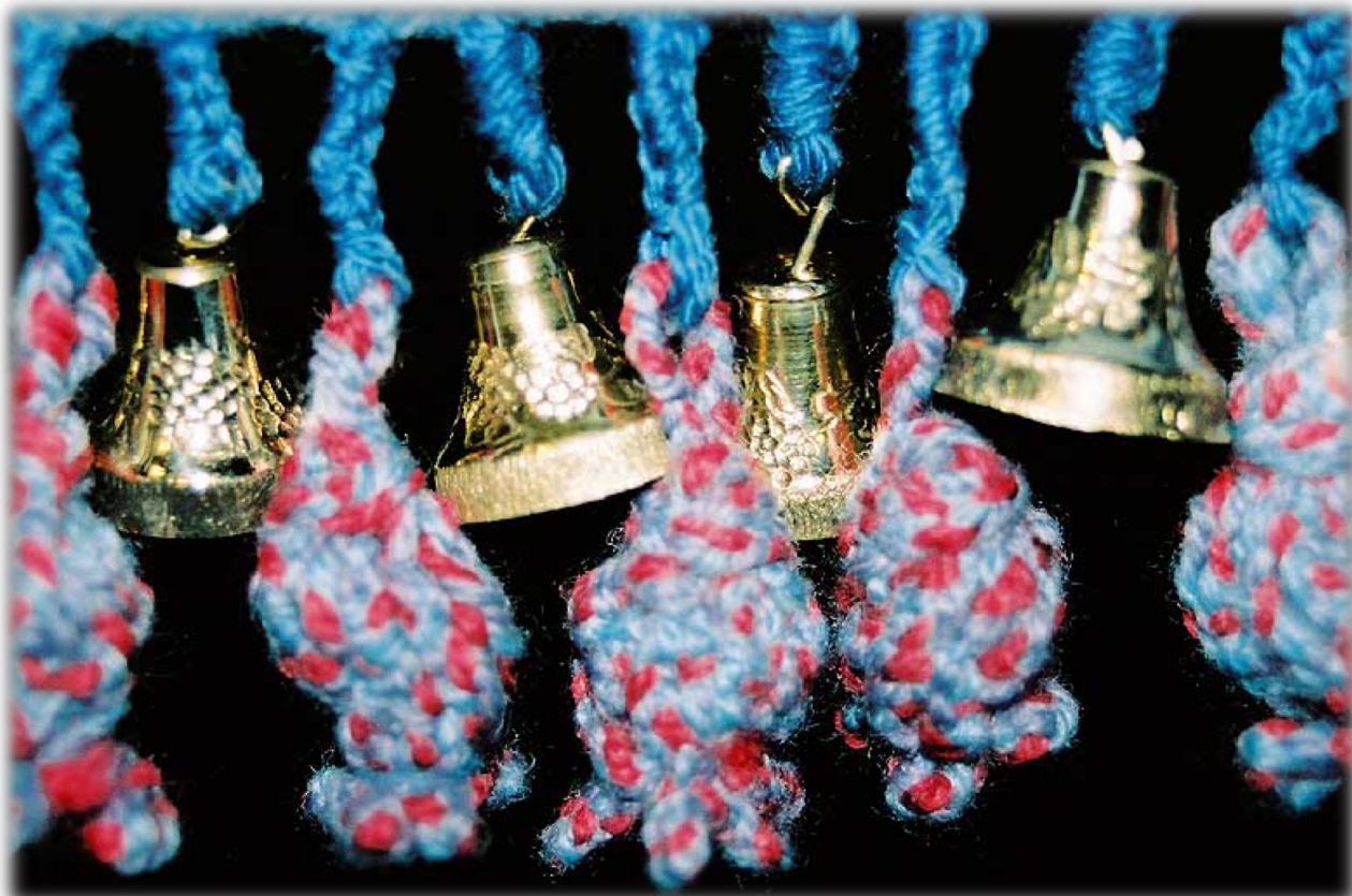
On the hem (near the ground) of the H.P.'s robe