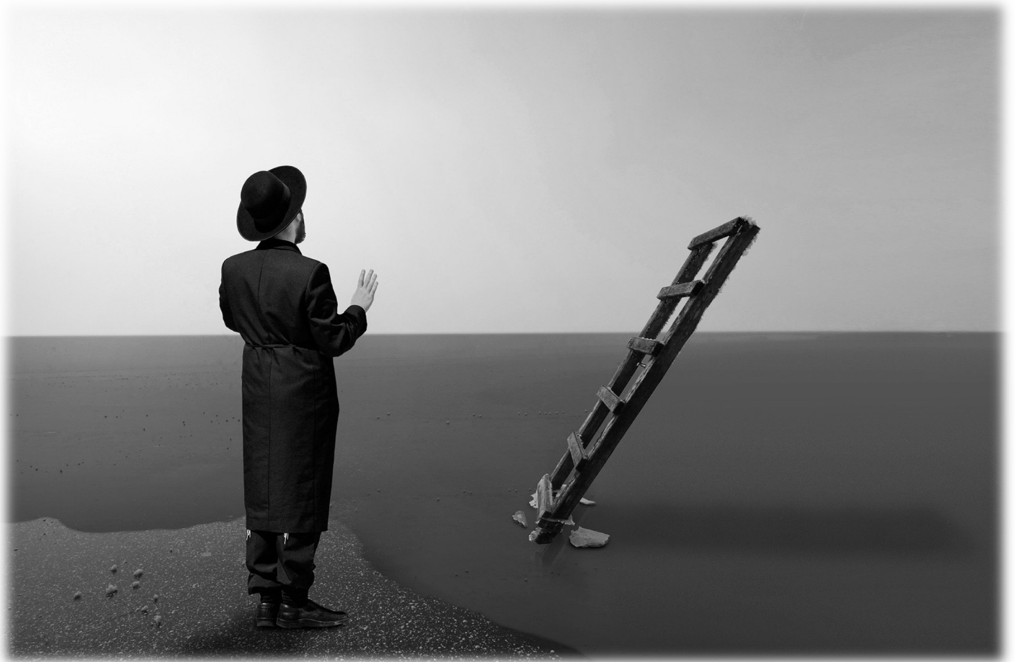
The Ascent by Zvi Suchet ( www.zvisuchet.com )