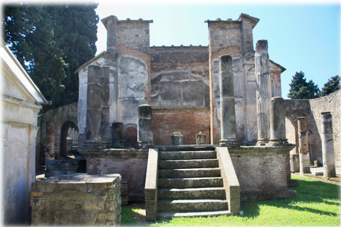
Temple to Isis