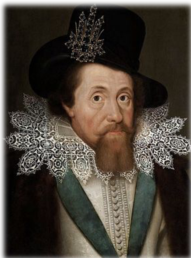
King James I