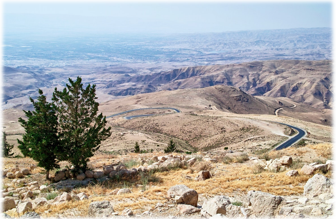
Mount Nebo (Jordan)