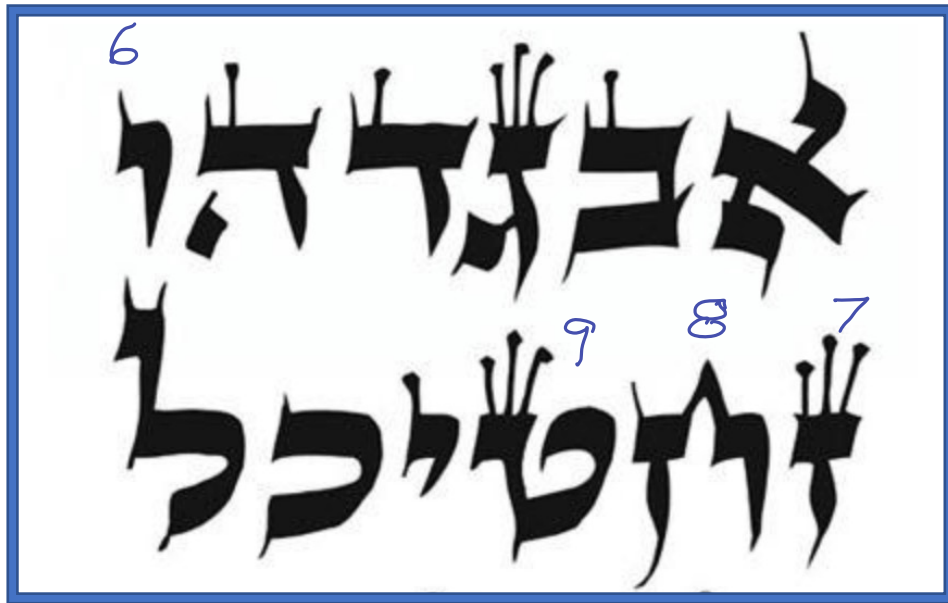
The First 12 Letters